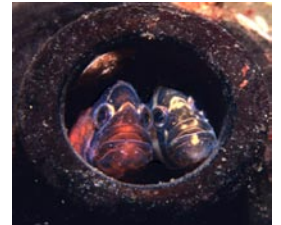
Pair of gunnels in beer bottle.

right here at home. We just have to look a little harder... If we do not have a plankton bloom, then visibility can be 20 to 30 feet in the summer." Enjoy this rare opportunity to see what floats, fins, and flutters just off our beaches beneath the surface in the cold sparkling waters of Puget Sound.