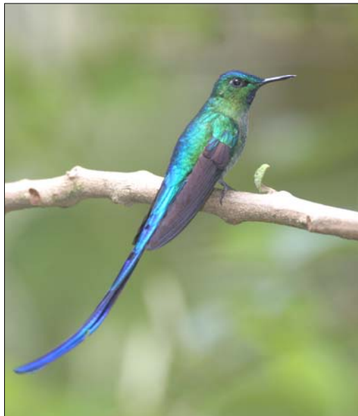
Long-tailed Sylph, Ecuador